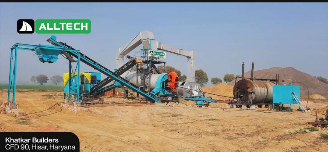
Khatkar Builders CFD 90, Hisar, Haryana