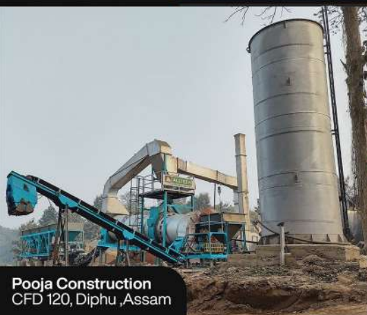
Pooja Construction CFD 120, Diphu, Assam