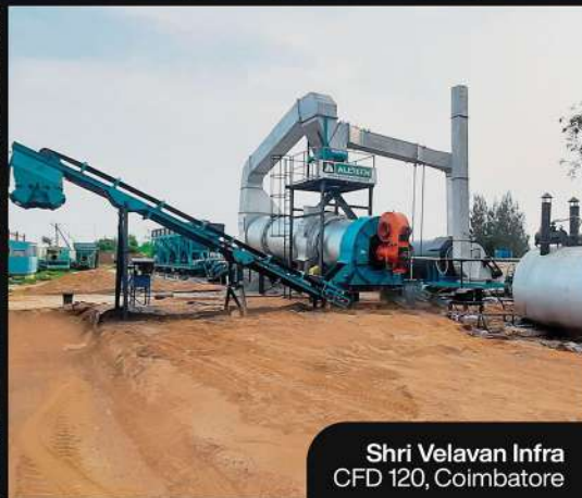
Shri Velavan Infra CFD 120, Coimbatore