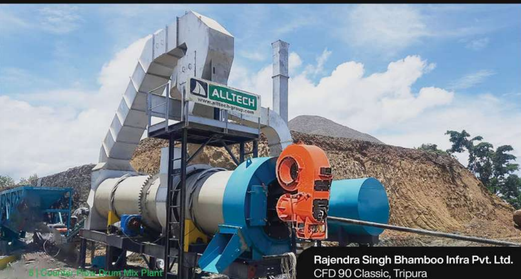
Rajendra Singh Bhamboo Infra Pvt. Ltd. CFD 90 Classic, Tripura